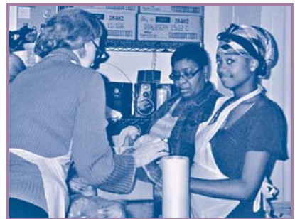
Volunteers from Deloitte packing food baskets at the Yorkville Community Pantry